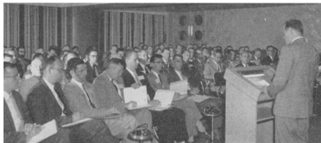
SHORT COURSE STUDENTS—Attentively listening to the speaker is this group at the 1958 short course on syndets and soaps at the Princeton Inn, Princeton, N. J., July 14-18, which was conducted by the American Oil Chemists' Society.